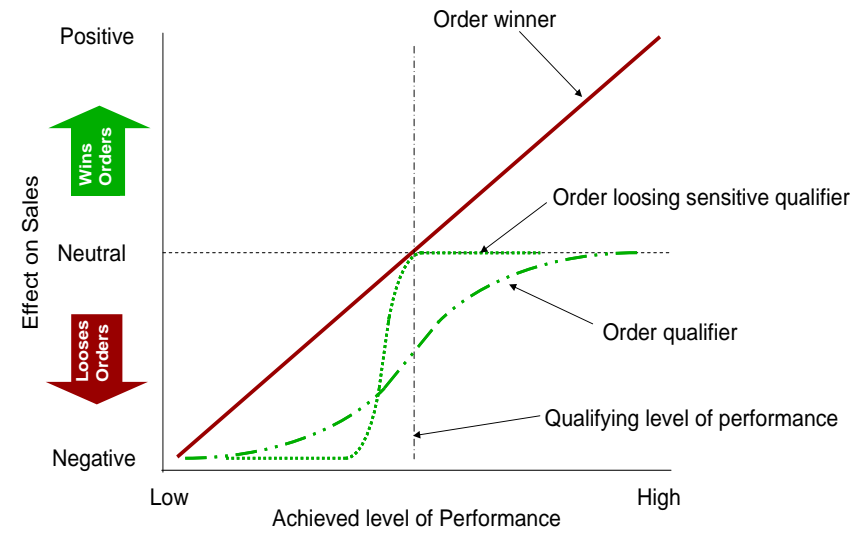
Table A1: : The Effect of Order Winners and Qualifiers on Sales (adapted from [3])

Order qualifying criteria are 'givens' that the customer expects to be there at a certain level. Exceeding this level is unlikely to bring in more sales and failure to deliver to this level leads to customer dissatisfaction. On the 1 to 5 scale, such customer requirements are rated as a 1 or 2.