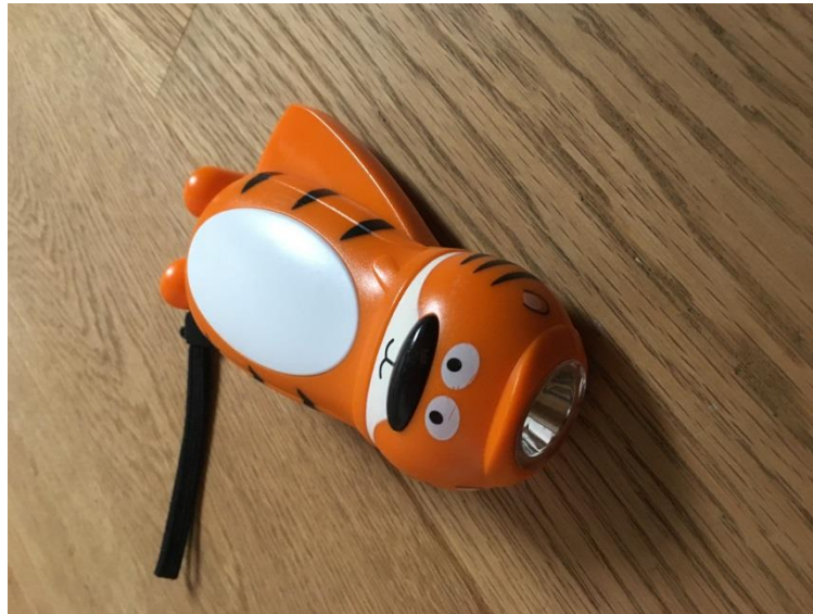
Figure 2: A tiger shaped hand generator LED torch

There are of course multiple combinations of the Morphological Box allowing for the creation of multiple whole system concepts that can be evaluated to find the “best”